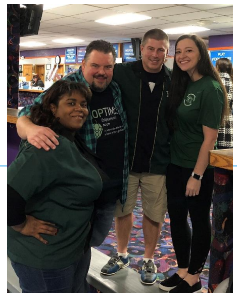
Bowling Extravaganza 2018