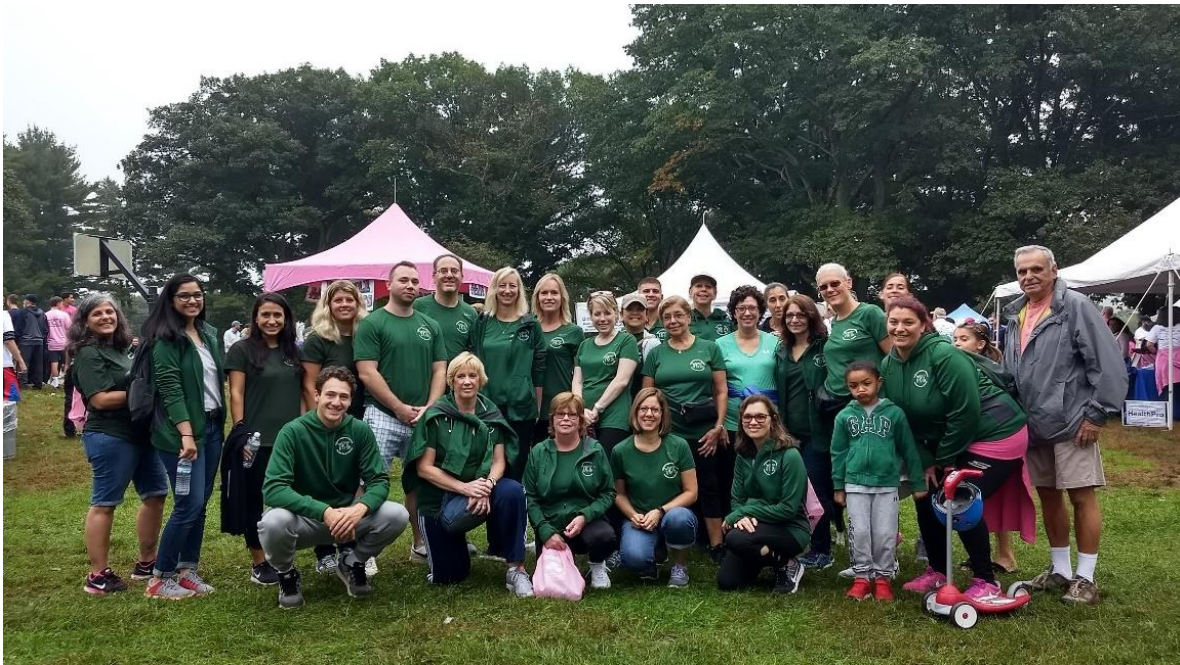
Support Connection Walk 2018

Created as a result of a resolution passed at the 1996 NYSUT RA, the NYSUT community service award recognizes those locals that have made a collective and sustained contribution to community service during the previous year. The efforts on the part of these locals have not only enhanced the learning opportunities of students but also enriched the quality of life in their communities. At the 2018 RA, the YCT was selected once again as a community service winner. Over the course of 2018 we donated nearly $20,000 to Support Connection, Alliance for Safe Kids, Yorktown Community Help and our own YCT local scholarships. Here are some photos of the YCT in action!